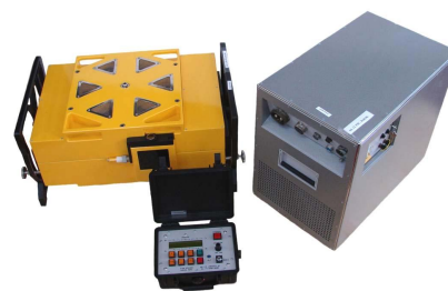
Fig. 1.2 A compact modern betatron X-ray source (yellow, left) and its power supply and control units [5]. The window is visible through the front with an alignment laser on its left.